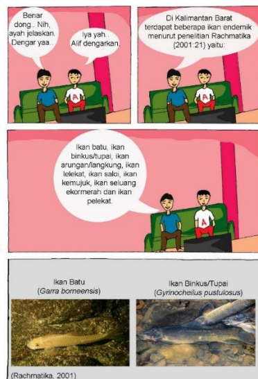
Figure 1. Examples of Comic Drawings

The data collected by the researchers included the feasibility of comics based on the local potential of endemic flora and fauna of West Kalimantan by validators and student responses to comics based on the local potential of endemic flora and fauna of West Kalimantan. The comics were made up of 41 pages with the image shown in the image below.