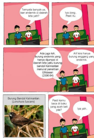
Figure 3. Examples of Comic Drawings