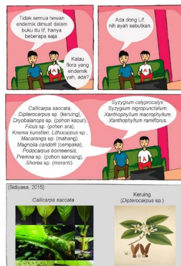
Figure 4. Examples of Comic Drawings